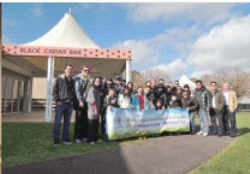
"Black Caviar" Bar 「魚子精華」酒吧