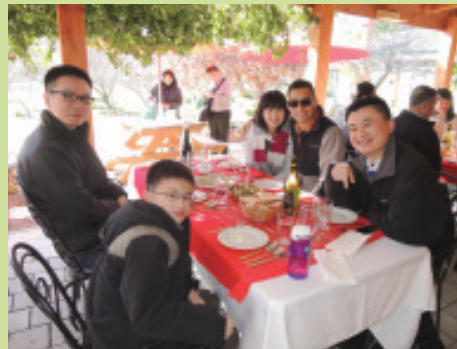
Outdoor lunch 田園午餐