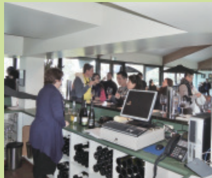
Wine tasting at Mitchelton Winery 酒莊內品嚐美酒