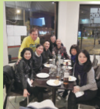
Aussie BBQ dinner 澳式燒烤晚餐