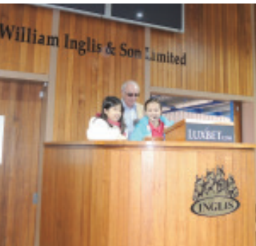
Kids acted as auctioneers 小朋友扮演拍賣官