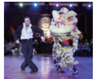
Comedy Lion Dance