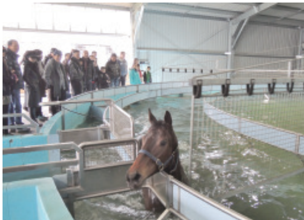
Water-walker training 馬匹水中行步訓練

大家共度了一個教育與娛樂兼老少咸宜的難忘旅程後，於8月5日懷著依依不捨的心情踏上歸途。