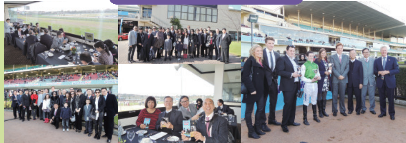
Enjoyed racing 觀賞賽事