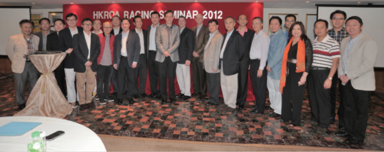
HKROA Council Members with Guest Speakers 馬主協會理事與主講嘉賓