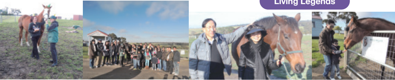
Horse birthday celebration - "Apache Cat" 慶祝馬匹生辰 - 「阿帕奇貓」