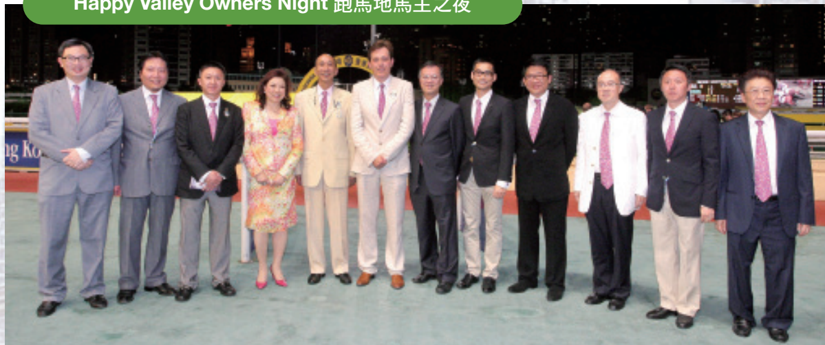
HKROA Council Members 馬主協會理事